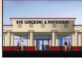
Winkelman Building Projects Underway