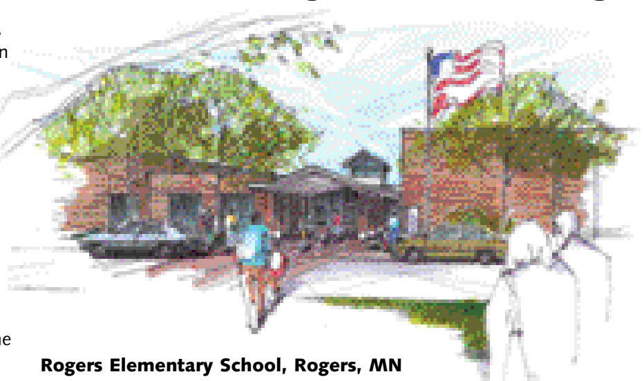
Rogers Elementary School, Rogers, MN