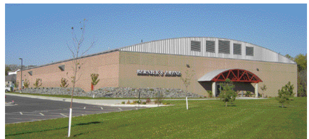
Bernick's Arena, Sartell, MN

WBC recently received word that they are a Behlen 2004 National Award Winner for Outstanding Performance in the Recreational Category for the Bernick's Arena project which was completed in Sartell in 2004. This 34,000 sq. ft. facility is constructed of pre-cast concrete wall panels and a Behlen S-Span roof system, clear spanning 132 feet. The facility features seating on two levels, multiple locker rooms, meeting rooms, a concession area, pro shop, offices and Zamboni storage. ✦