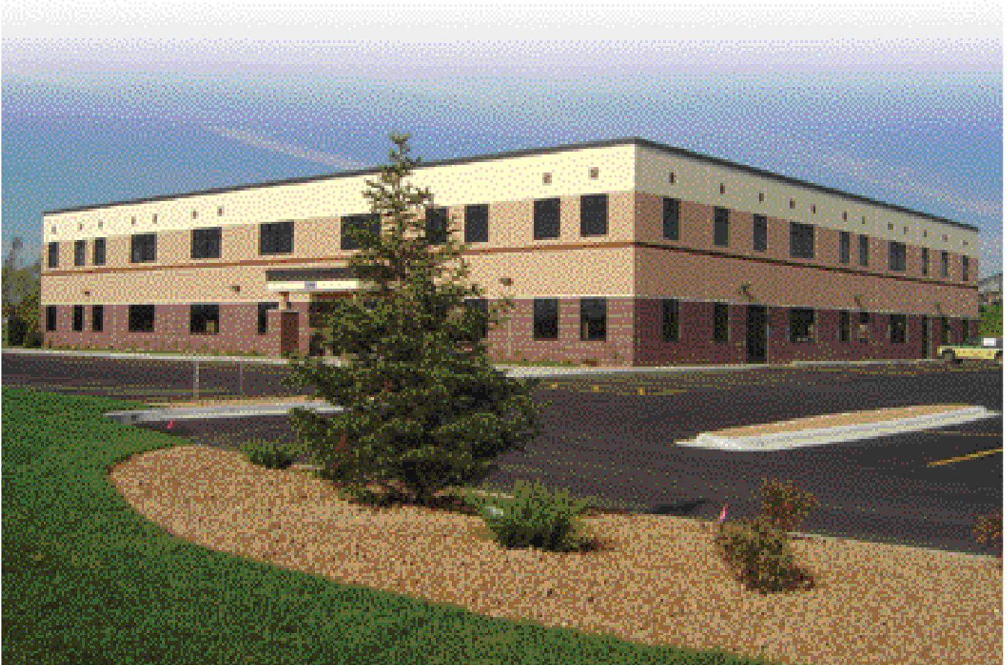
Minnesota School of Business Waite Park, MN