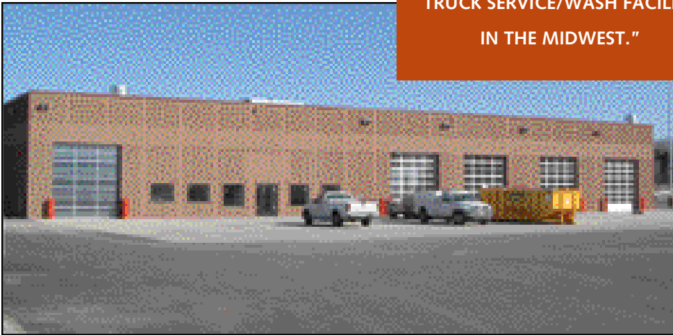
Trails Truck Service Center, Albert Lea, MN