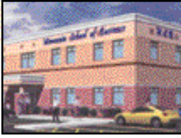
Featured Client – MSB/GC